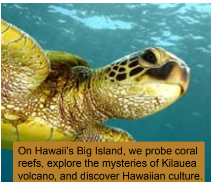
On Hawaii's Big Island, we probe coral reefs, explore the mysteries of Kilauea volcano, and discover Hawaiian culture.

Earth Explore provides an Education Coordinator, Logistics Manager and onsite Travel Manager. This means that every step of the way our groups are supported by professional, highly competent travel experts, with years of educational and logistics experience.