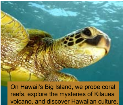
On Hawaii's Big Island, we probe coral reefs, explore the mysteries of Kilauea volcano, and discover Hawaiian culture.

Earth Explore provides an Education Coordinator, Logistics Manager and onsite Travel Manager. This means that every step of the way our groups are supported by professional, highly competent travel experts, with years of educational and logistics experience.