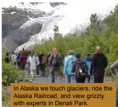
In Alaska we touch glaciers, ride the Alaska Railroad, and view grizzly with experts in Denali Park.