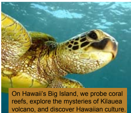
On Hawaii's Big Island, we probe coral reefs, explore the mysteries of Kilauea volcano, and discover Hawaiian culture.

Step Three: Attend your upcoming group meetings with your teacher and meet your fellow Earth Explore travelers.